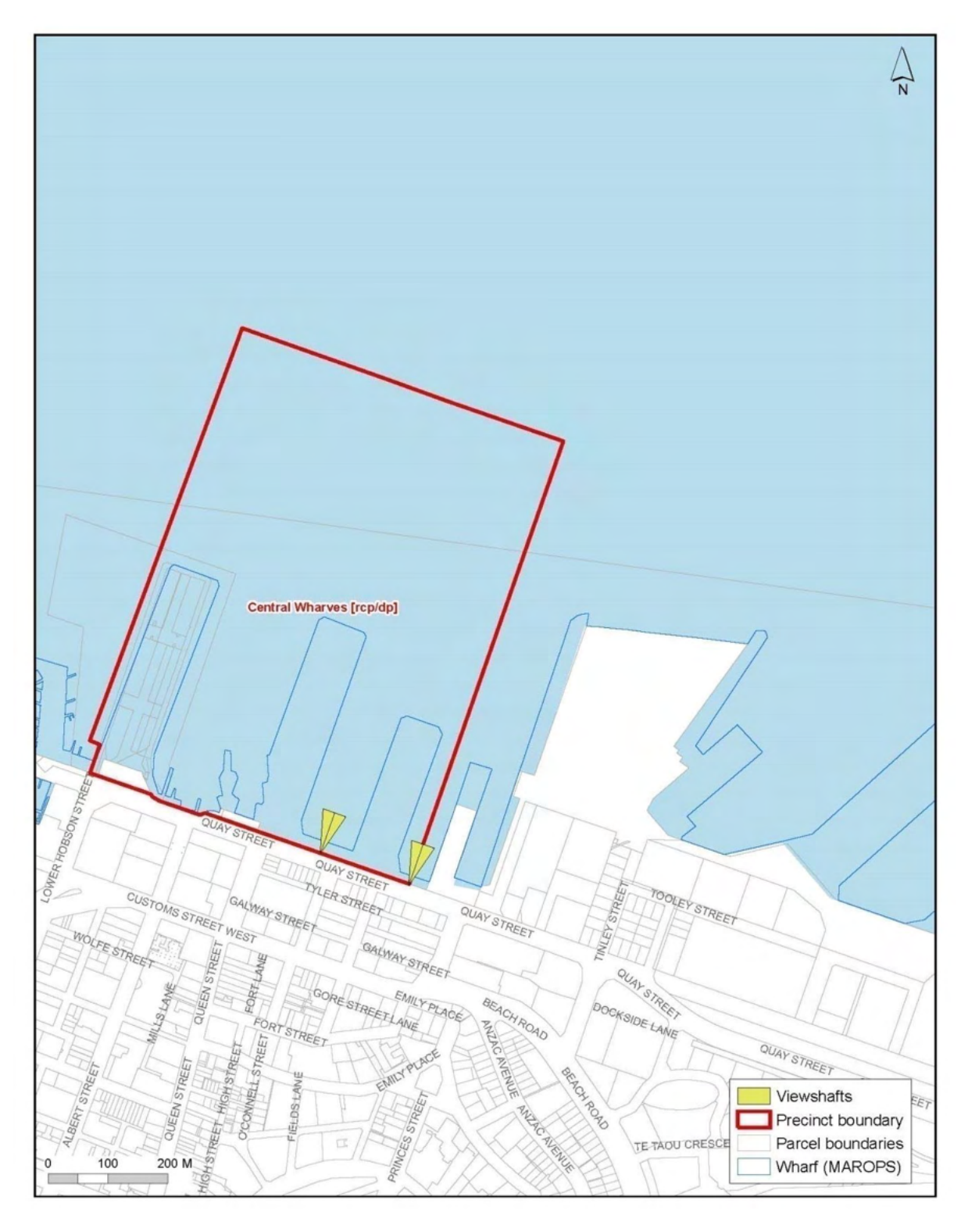
I202.10.2 Central Wharves: Precinct plan 2 - Viewshafts